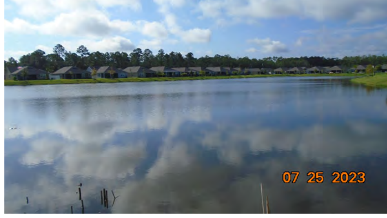
Pond 4: This pond was in good condition. Had a good kill on the cattail.