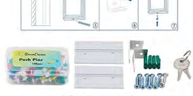
Roll over image to zoom in

Coupon: Apply $10 coupon Shop items > | Terms Available at a lower price from other sellers that may not offer free Prime shipping. Size: 36x24 inches 36x24 inches 70x34 inches Color: Cork Material Cork, Acrylic Cork Color Brand S SWANCROWN Size 36x24 inches Shape Rectangular