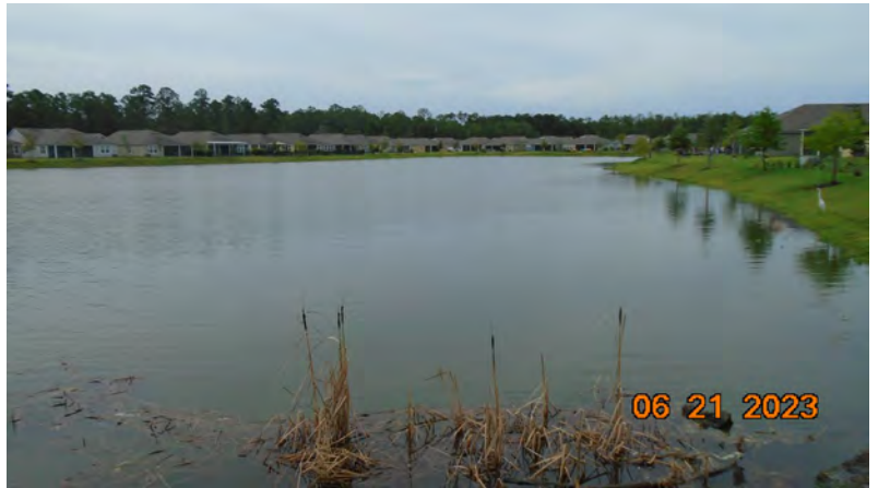
Pond 4: This pond was in good condition. Had a good kill on the cattail.

Pond 3: This pond was in good condition. Had a good kill on the perimeter vegetation and cattail.