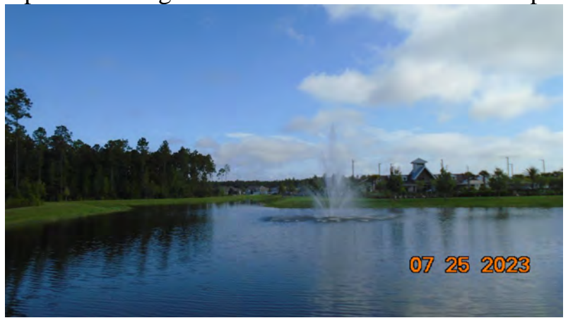
Pond 2: This pond was in good condition. No new invasive species noted.

Pond 1: This pond was in good condition. No New invasive species noted.