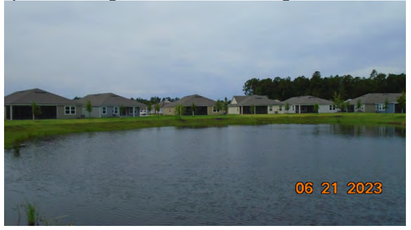
Pond 5: This pond was in good condition. No invasive species noted. Major construction is going on.